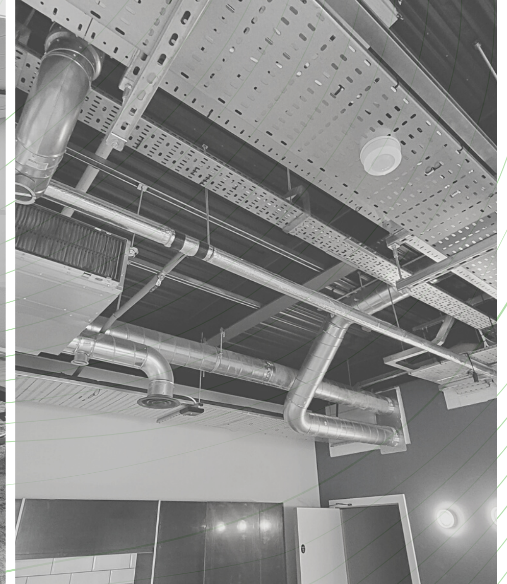
No1 Bourne Quarter Mechanical Installation Budget: £425k Duration: 8 weeks