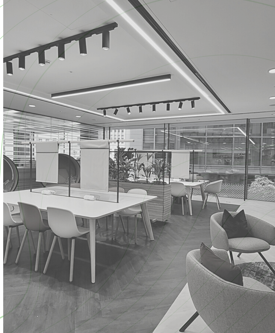
70 Mark Lane Office fitout Budget: £30k Duration: 2 weeks