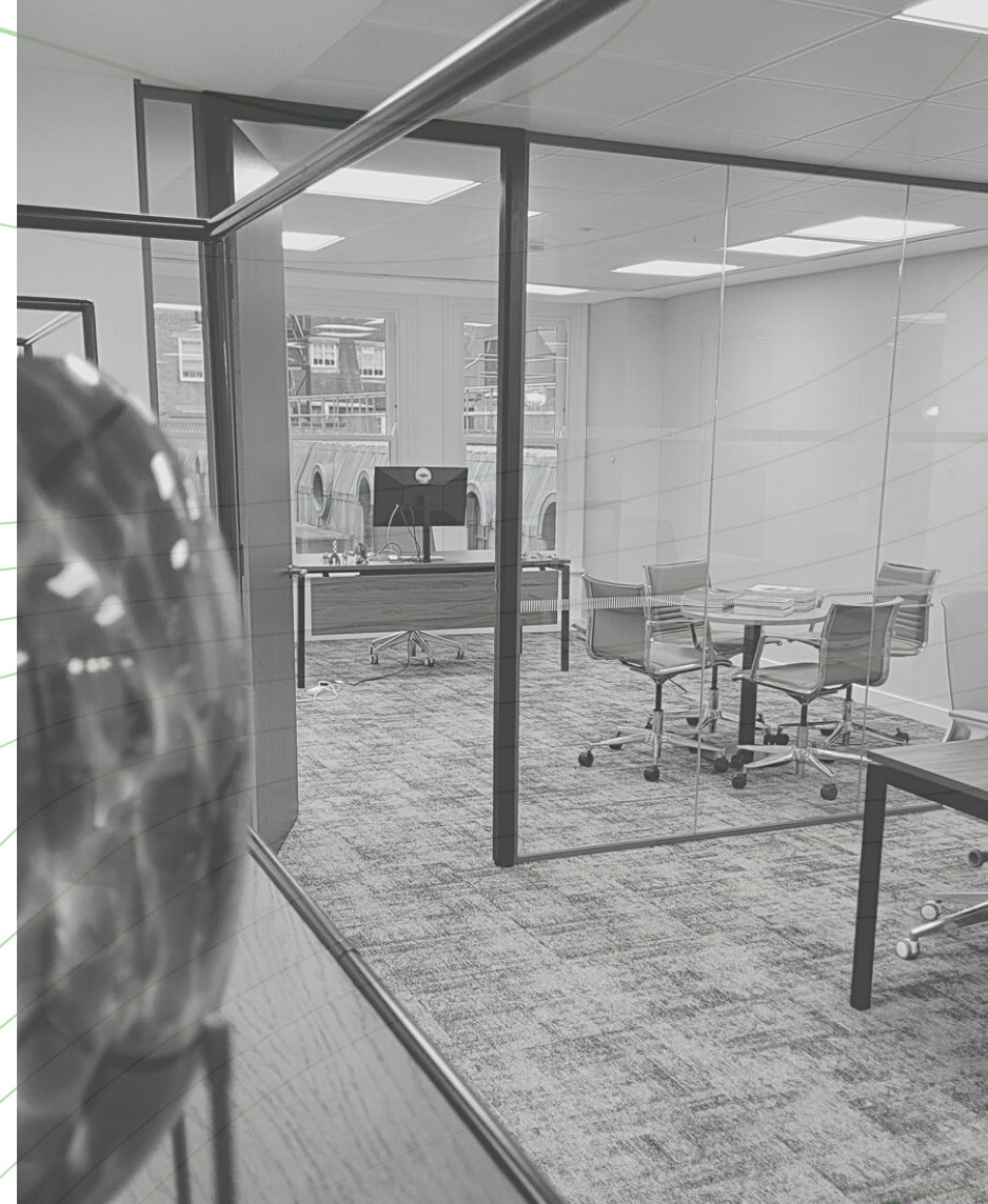
86 Jermyn Street Office fitout Budget: £160k Duration: 3 weeks